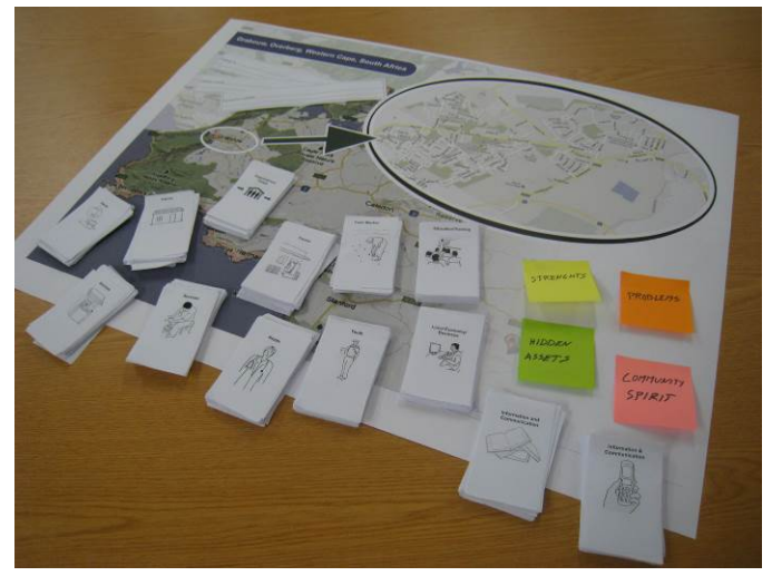
Figure 1 – Template and visual tools developed for the context mapping exercise