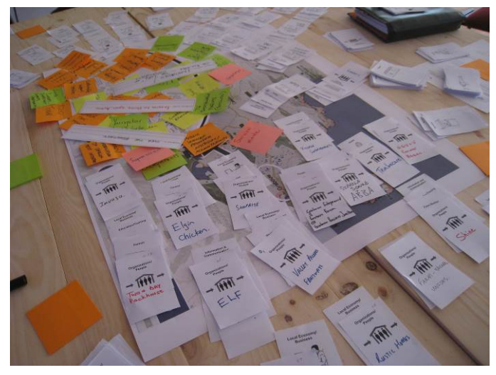
Figures 3 and 4 – Context mapping exercise in Grabouw